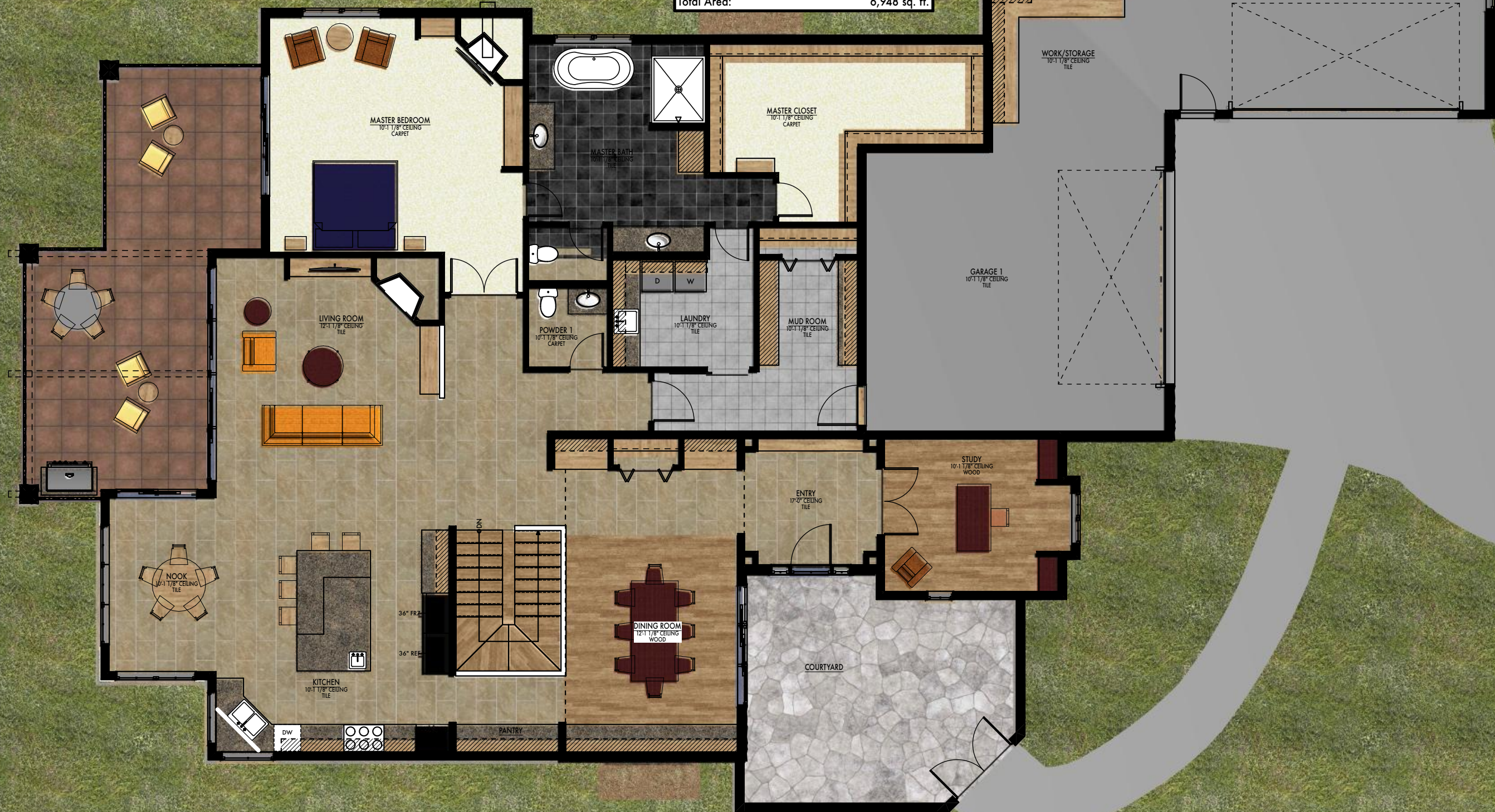
Main Level Floor Plan

Garage Area: 1,193 sq. ft. Total Area: 6,948 sq. ft.